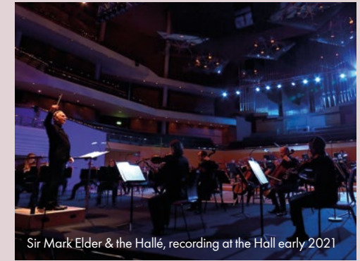
Sir Mark Elder & the Hallé, recording at the Hall early 2021