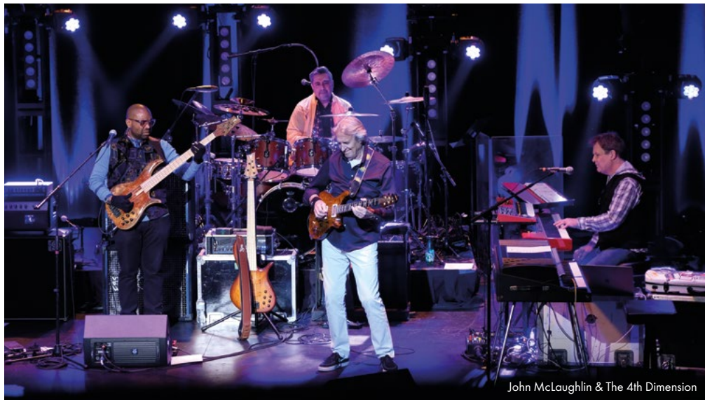
John McLaughlin & The 4th Dimension