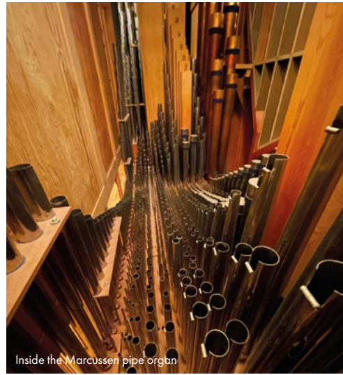
Inside the Marcussen pipe organ

When you do visit, it's worth remembering that the 22,500 ton construction you're standing in has no rigid contact with its foundations. Instead, the whole concrete structure is supported by earthquake-proof isolation bearings, or giant springs, so that the performance space is isolated from any external vibrations that might mar the acoustics.