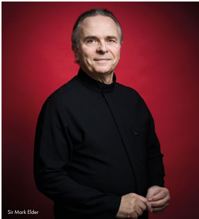
Sir Mark Elder