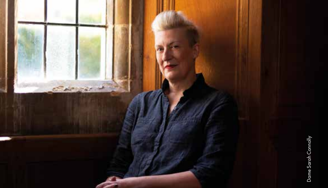
Dame Sarah Connolly