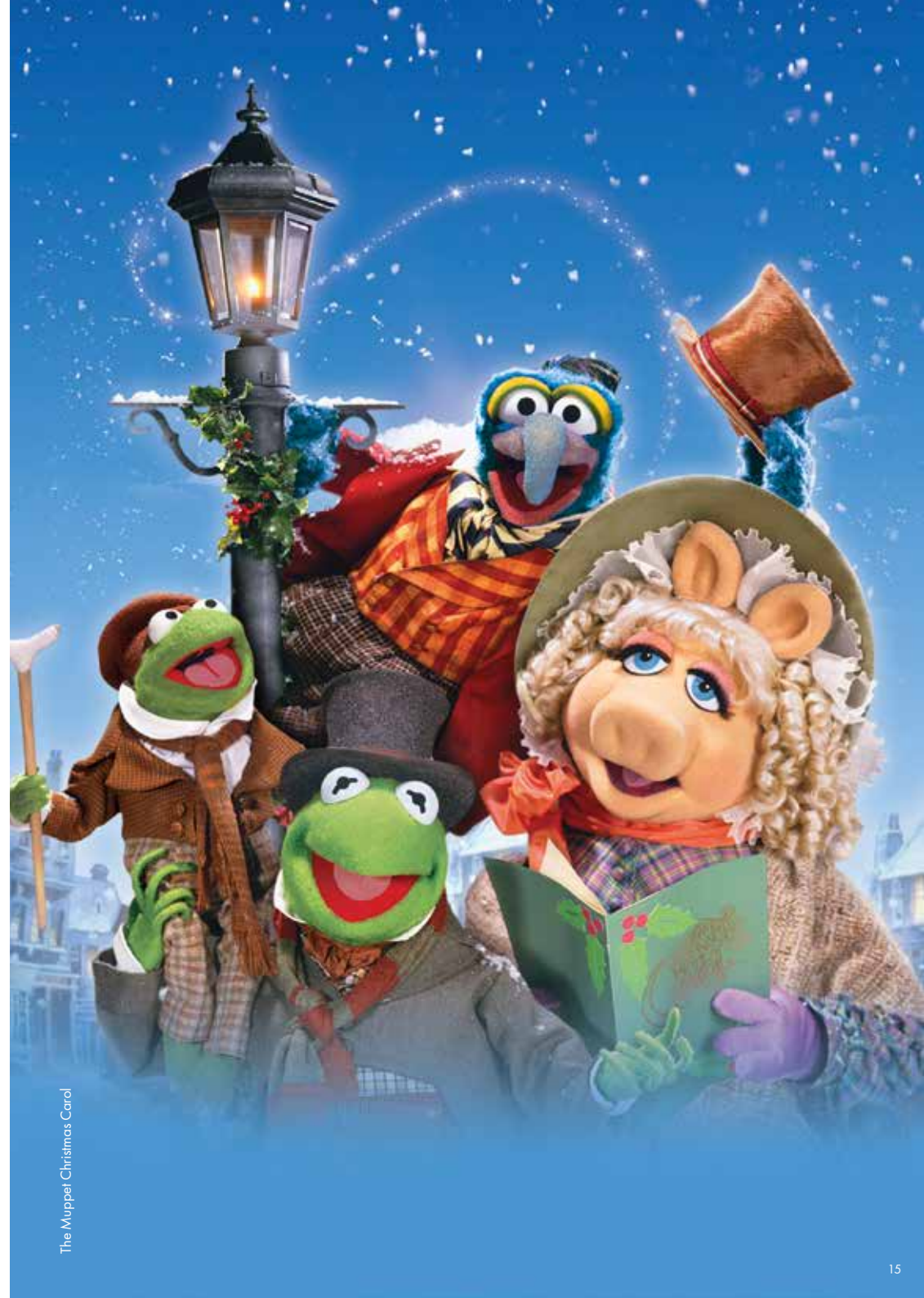
The Muppet Christmas Carol