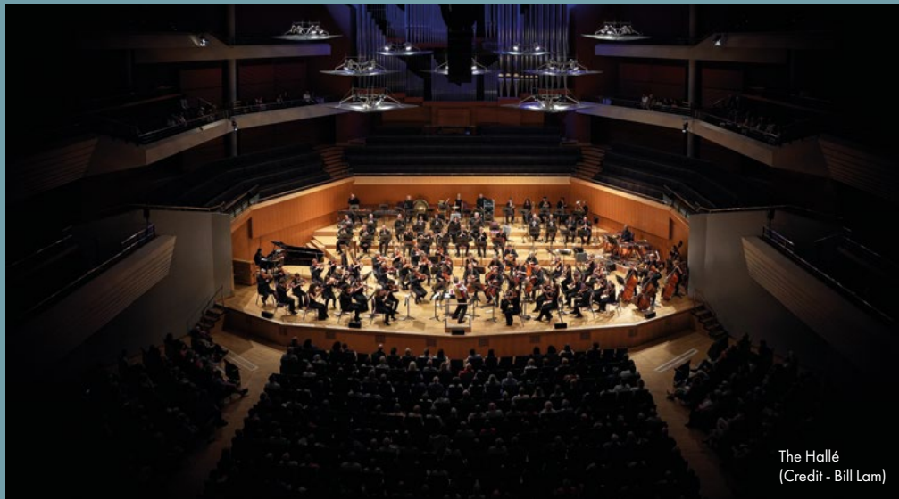
The Hallé

dive into the music of perhaps our most important living composer.