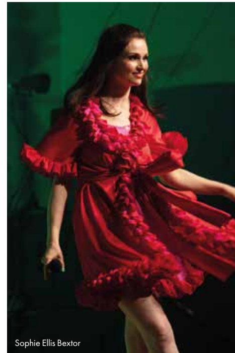
Sophie Ellis Bextor