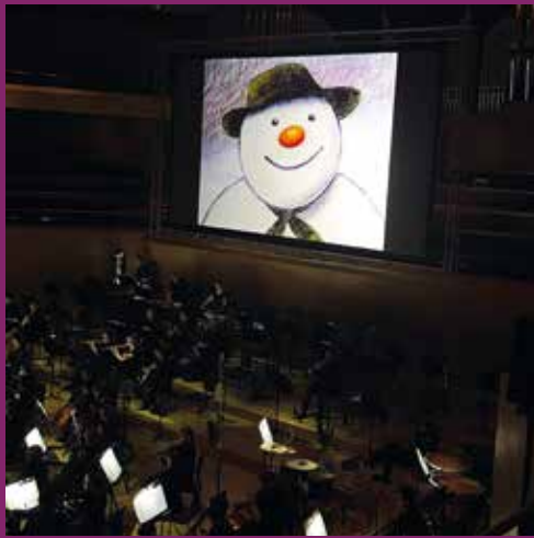
Carol, Love Actually and The Snowman, also on the programme at the Hall.