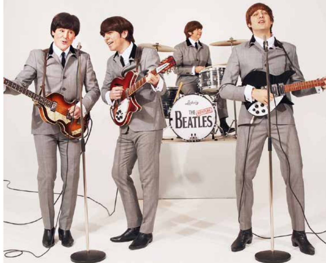
The Bootleg Beatles